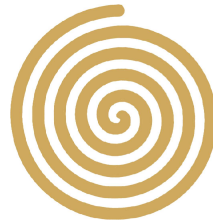
Quantum field spiral