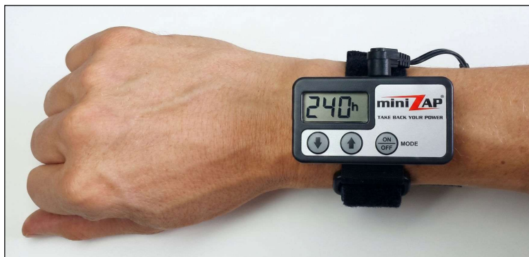
miniZAP® on the wrist.

The miniZAP® is the only Beck zapper on the market where the desired current is digitally set and displayed. The electronics is designed to minimise power consumption to ensure maximum battery life and thus lowest operating costs.