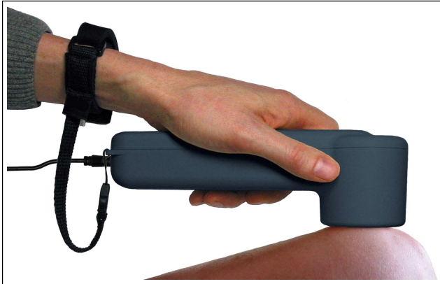
Example for application of the Parapulser® at the knee joint